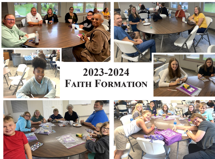
2023-2024 FAITH FORMATION

Holistic Catholic Counseling www.sacredheartcleveland.com 440-305-6192