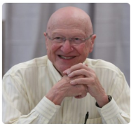
Dr. Peter Kreeft