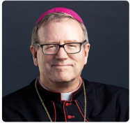
Bishop Robert Barron