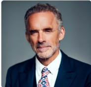
Dr. Jordan B. Peterson