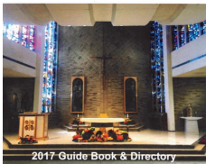
2017 Guide Book & Directory