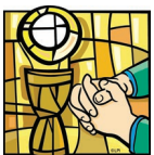
Day of Recollection

REFLECTING UPON AND ASKING GOD FOR THE COURAGE TO ACCEPT AND TO LIVE IN ACCORD WITH HIS WILL"