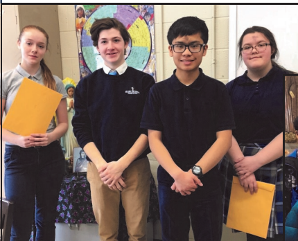
Davis Scholarship Participants