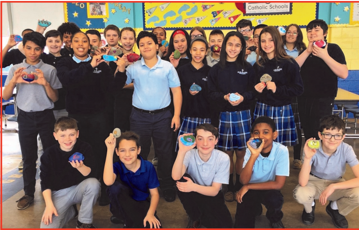
6th Graders Painted "Rocks of Faith" for Lent