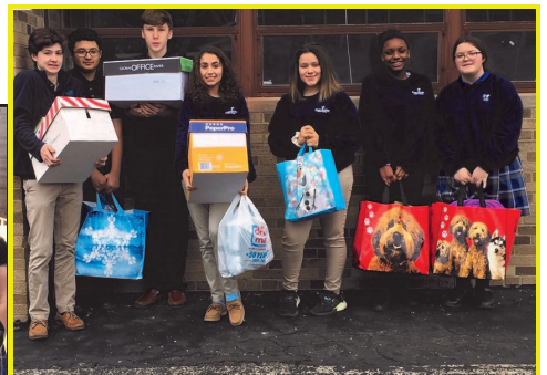
Davis Scholarship Participants Deliver to Holy Family Hospice