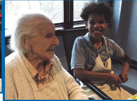
8th Graders returned to Broadview Multi-Care for the Spring Session of OMA (Opening Minds through Arts)